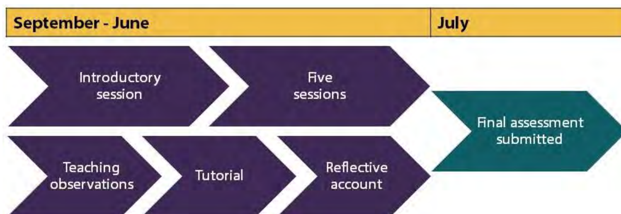
Figure 1 An overview of the Advancing Educational Practice Programme timeline

The Advancing Educational Practice Programme lasts ten months and runs from September to July each academic year. There is an initial introductory session followed by five further sessions, between September and June, as well as teaching observations and tutorials. Participants are expected to submit their final assessed work by July.